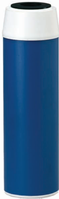
CGT-10 Replacement Cartridge: DEV9108-11