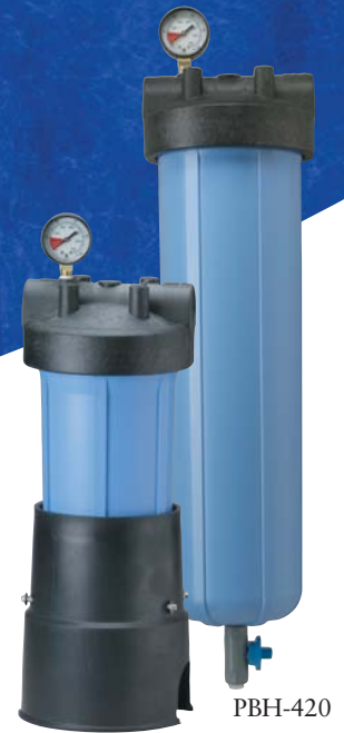
PBH-410 (shown with bag vessel stand)